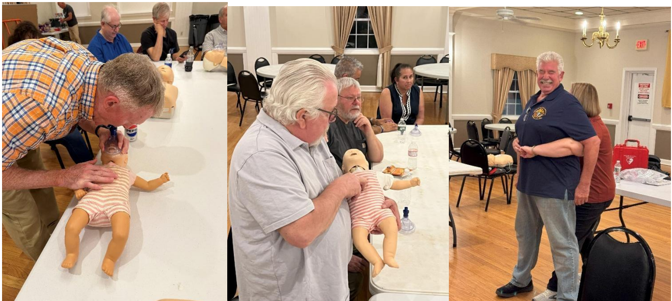
CPR, AED AND HEIMLICH MANEUVER TRAINING AT THE COUNCIL MANY KNIGHTS AND THEIR FAMILIES ARE NOW CERTIFIED SAVE A LIFE!