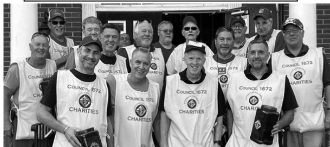
CHARITABLE CANNING DRIVE CREW

My Dear Brothers and your families, from myself and all the Freehold Council 1672 Officers Thank You! For such an outstanding 2024 Have A wonderful Thanksgiving, a very Merry Christmas and a Happy New Year!