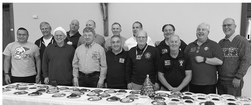
ST. ROBERT'S "COFFEE AND" Crew