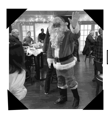
Santa Claus at Kids Party