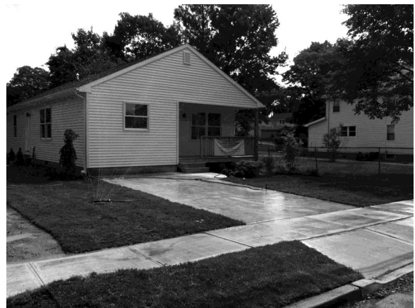
The Tello Family will reside in the new house located on Center Street in Freehold Borough