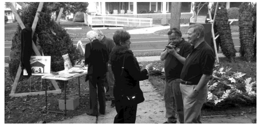
Christmas Tree / Wreath Sale