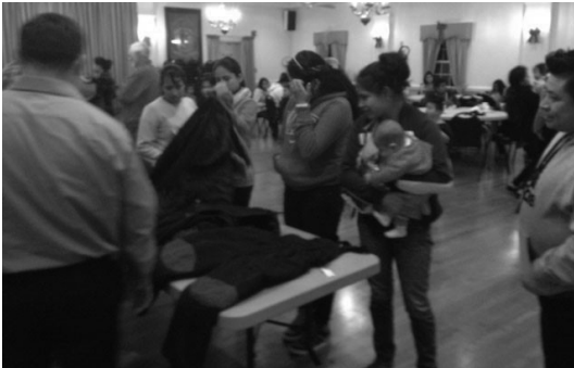
Coats for Kids Distributing Event