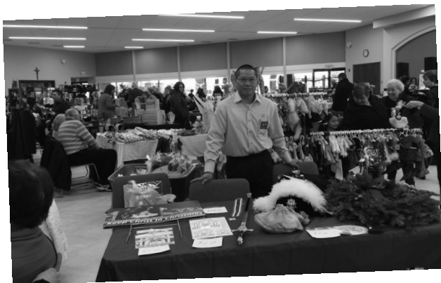
St. Robert's Christmas Bazaar