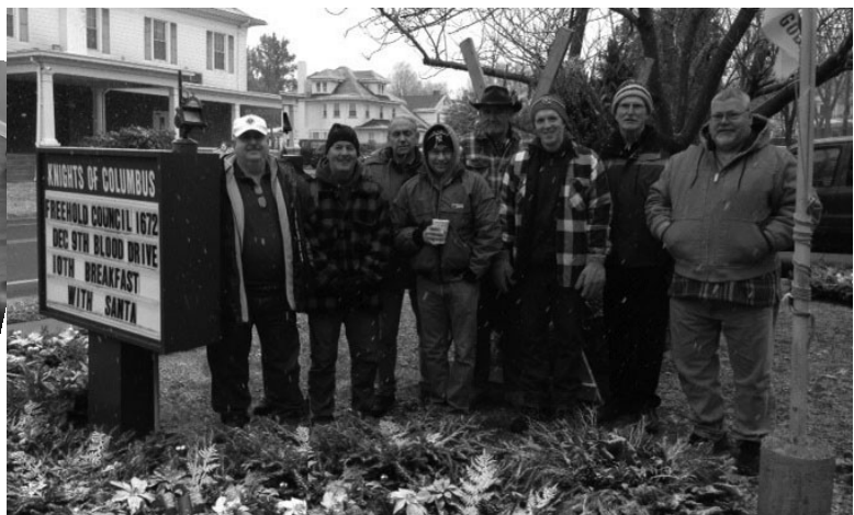
Grave Blanket Salesmen - (Gino was Photoshopped in)