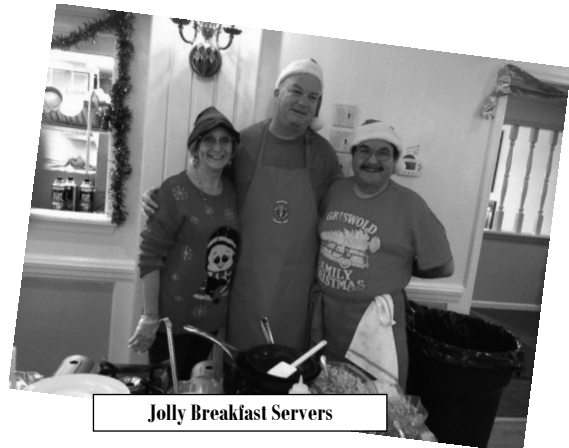
Jolly Breakfast Servers