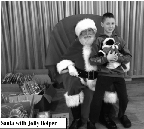
Jolly Santa with Jolly Helper