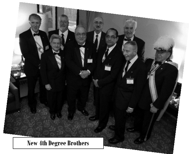
New 4th Degree Brothers