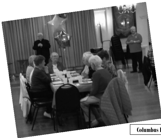
Columbus Day Dinner

As most of you already know, my wife and I will be spending some of this winter in "nicer" weather, but I will be looking forward to our return to "Joisey" and meeting once again with all of you Brothers.